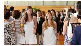
Penn student, and Boston bombing victim, is struggling back