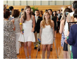
Penn student, and Boston bombing victim, is struggling back