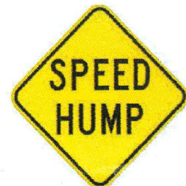
Advance Warning Sign